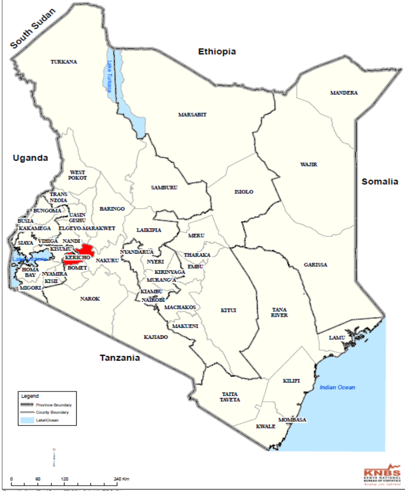
Map 1: Location of the Kericho County in Kenya